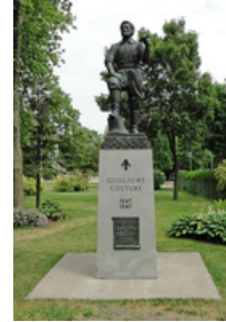
COUTURE, GUILLAUME (d. 1701)