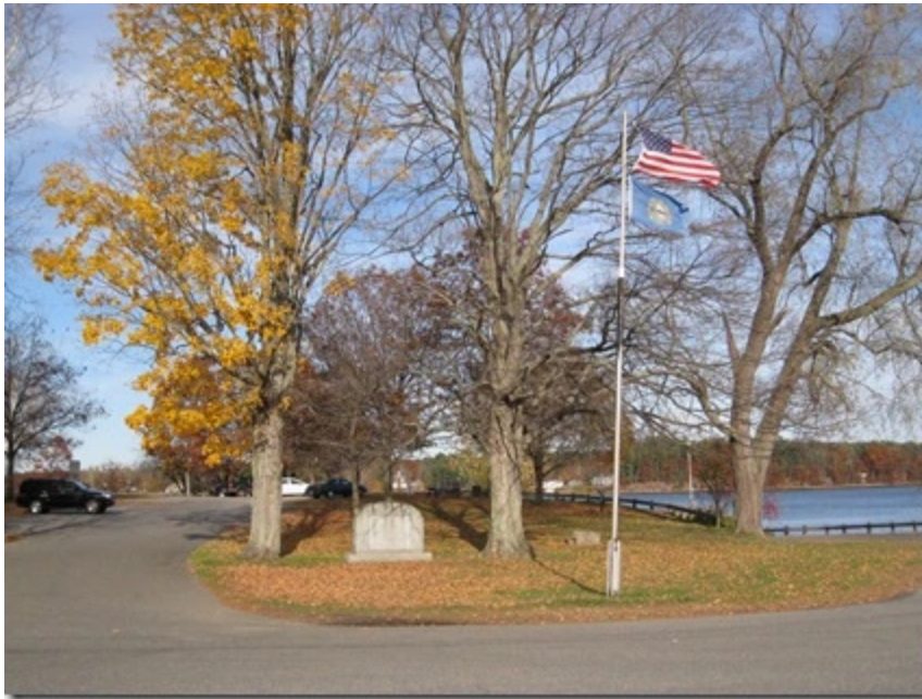
( https://mikenh.files.wordpress.com/2009/11/img_0272.jpg ) Hilton's Point State Park, 11/01/09

( http://maps.google.com/maps/ms?hl=en&ie=UTF8&msa=0&msid=104430403169079503003.000478fc9f78034 )