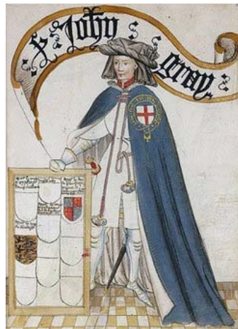
Added by: aba