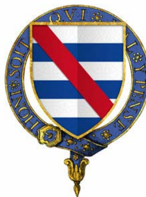
Added by: aba