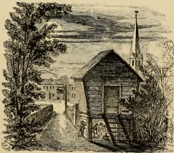
THE OLD HOMESTEAD.