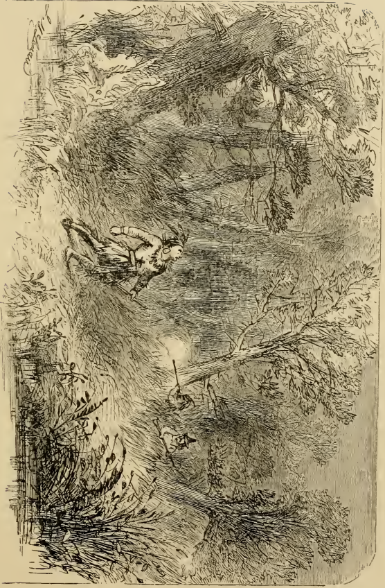
DEATH OF PHILIP.