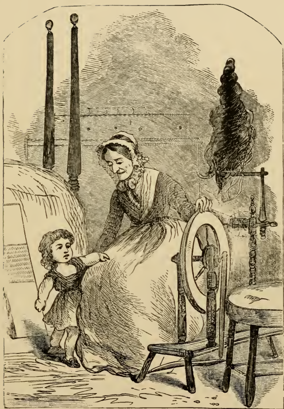
THE WHEEL OF THE OLDEN TIME.