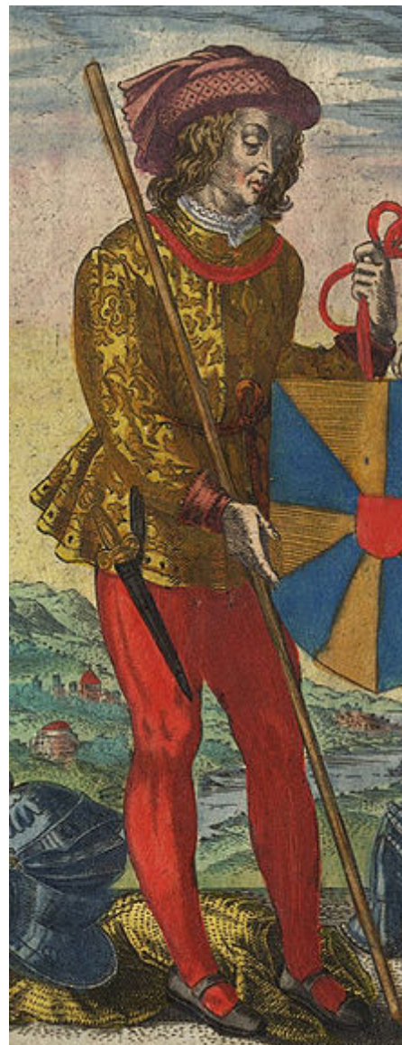
Baldwin VI, Count of Flanders & Hainaut