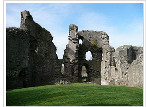
Abergavenny Castle in Monmouthshire, Wales, was one of the castles Bertha of Hereford brought to her husband William de Braose, 3rd Lord of Bramber