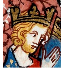
A depiction of Henry from Chroniques de France ou de St Denis