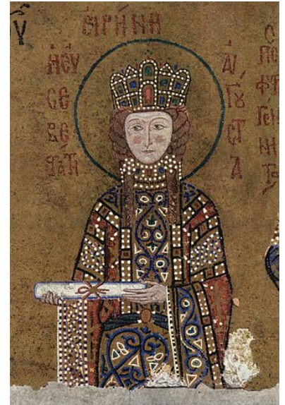
Mosaic portrait of Empress Irene on the Comnenos mosaic in the Hagia Sophia, Constantinople (now Istanbul)