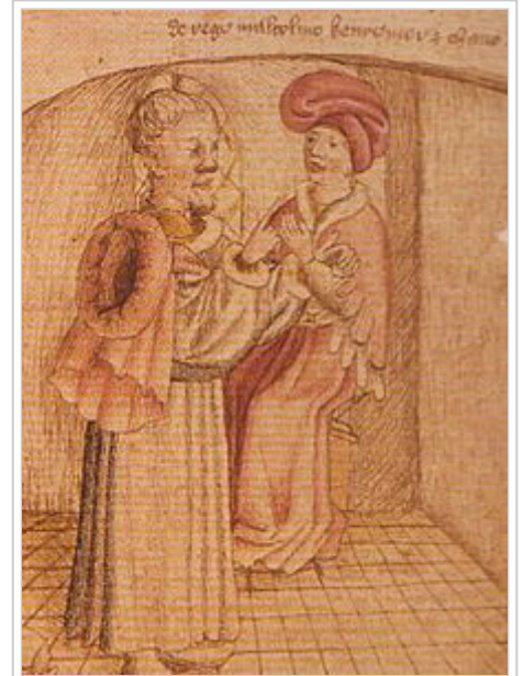
Late medieval depiction of Malcolm with MacDuff, from an MS (Corpus Christi MS 171) of Walter Bower's Scotichronicon

The naming of their children represented a break with the traditional Scots regal names such as Malcolm, Cináed and Áed. The point of naming Margaret's sons—Edward after her father Edward the Exile, Edmund for her grandfather Edmund Ironside, Ethelred for her great-grandfather Ethelred the Unready and Edgar for her great-great-grandfather Edgar and her brother, briefly the elected king, Edgar Ætheling—was unlikely to be missed in