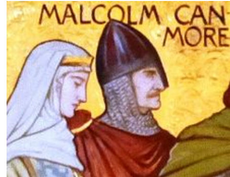
Victorian depiction of Malcolm and his second wife, Margaret