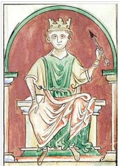
William Rufus, "the Red", king of the English (1087–1100)

In 1092, the peace began to break down. Based on the idea that the Scots controlled much of modern Cumbria, it had been supposed that William Rufus's new castle at Carlisle and his settlement of English peasants in the surrounds was the cause. It is unlikely that Malcolm controlled Cumbria, and the dispute instead concerned the estates granted to Malcolm by William Rufus's father in 1072 for his maintenance when visiting England. Malcolm sent messengers to discuss the question and William Rufus agreed to a meeting. Malcolm travelled south to Gloucester, stopping at Wilton Abbey to visit his daughter Edith and sister-in-law Cristina. Malcolm arrived there on 24 August 1093 to find that William Rufus refused to negotiate, insisting that the dispute be judged by the English barons. This Malcolm refused to accept, and returned immediately to Scotland. [49]