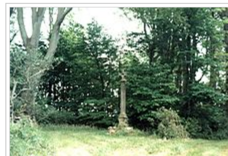
Memorial cross said to mark the spot where King Malcolm III of Scotland was killed while besieging Alnwick Castle in 1093.

Mael Coluim son of Donnchad, over-king of Scotland, and Edward his son, were killed by the French [i.e. Normans] in Inber Alda in England. His queen, Margaret, moreover, died of sorrow for him within nine days. [56]