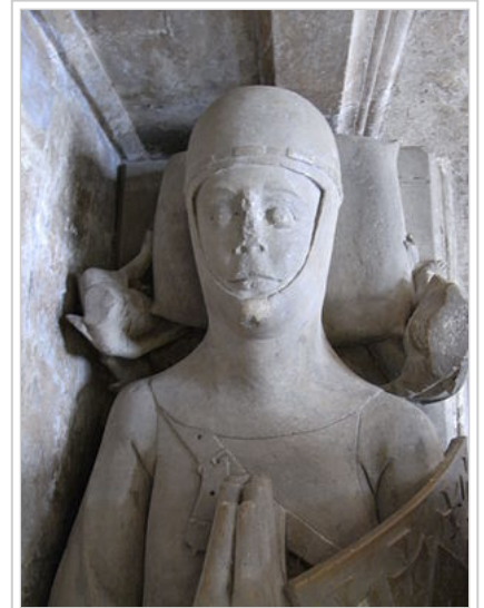
Effigy of Maurice de Berkeley, 2nd Baron Berkeley (died 1326) "The Magnanimous", St Augustine's Abbey, Bristol (Bristol Cathedral)