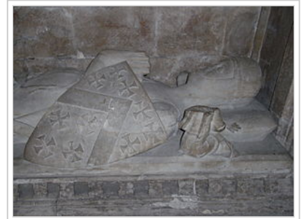
Effigy of Maurice de Berkeley, 2nd Baron Berkeley (d.1326) "The Magnanimous", St Augustine's Abbey, Bristol (Bristol Cathedral). The Berkeley arms are visible on his shield