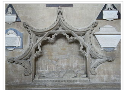
Full-view of monument