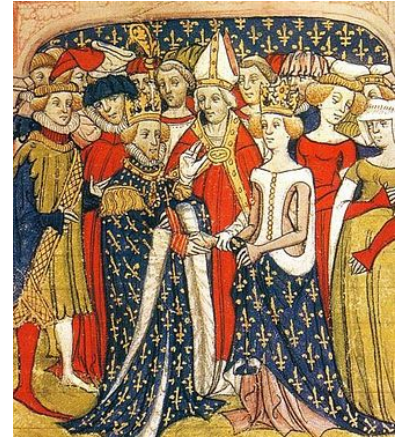
Marriage of Philip and Marie of Brabant, Queen of France