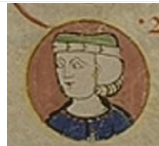
Count of Artois