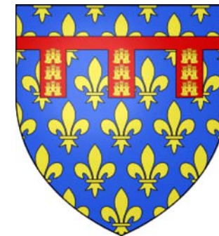
Coat of Arms of Robert of Artois

While participating in the Seventh Crusade , Robert died while leading a reckless attack on Al Mansurah , without the knowledge of his brother King Louis IX . [6] He and the Templars after fording a river, charged a Mamluk outpost in which the Mamluk commander, Fakhr-ad-Din Yusuf, was killed. [6] Emboldened by his success, Robert, the Templar knights, and a contingent of English troops charged into the town and became trapped in the narrow streets. [6] According to Jean de Joinville , he defended himself for some time in a house there, but was at last overpowered and killed.