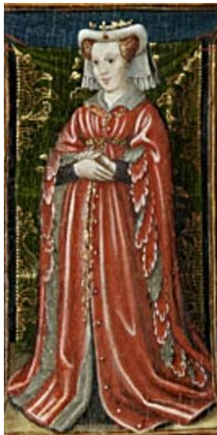
Rozala of Italy

Rozala retired back to Flanders, where she died and was buried. Robert retained control of her "dowry", [3] or the rights to the mentioned territory.