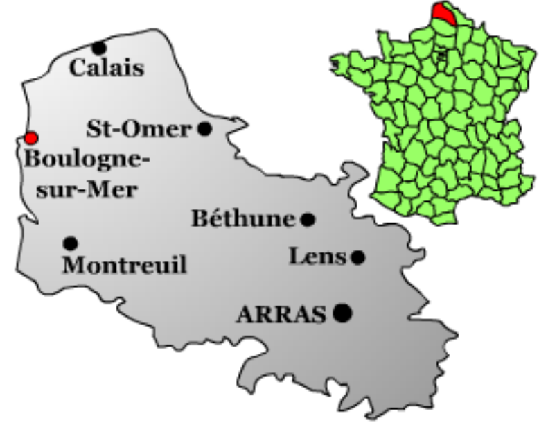
Map of the county of Boulogne

He was apparently a patron of Samer Abbey near Calais and he is said to have been buried there.<sup>[9]</sup>