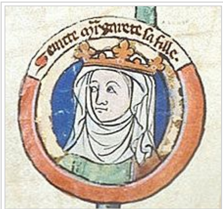
Margaret from a medieval family tree.

Margaret was the daughter of the English prince Edward the Exile, and granddaughter of Edmund Ironside, king of England. [1] After the Danish conquest of England in 1016, Canute had the infant Edward exiled to the continent. He was taken first to the court of the Swedish king, Olof Skötkonung, and then to Kiev. As an adult, he travelled to