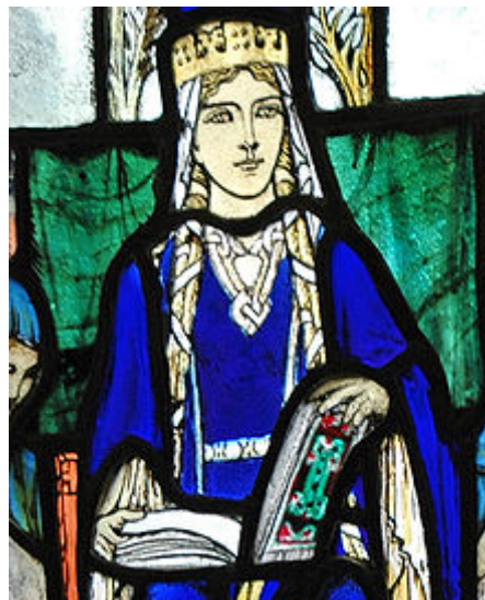
Image of Saint Margaret in a window at St Margaret's Chapel, Edinburgh