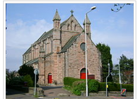
St Margaret's Church in Dunfermline