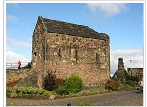
St Margaret's Chapel, Edinburgh Castle