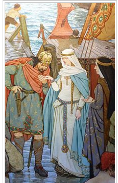
Malcolm greeting Margaret on her arrival in Scotland. Detail from a mural by the Victorian artist William Hole

She attended to charitable works, serving orphans and the poor every day before she ate, and washing the feet of the poor in imitation of Christ. She rose at midnight every night to attend church services. She invited the Benedictine order to establish a monastery at Dunfermline in Fife in 1072, and established ferries at Queensferry and North Berwick to assist pilgrims journeying from south of the Firth of Forth to St. Andrews in Fife. A cave on the banks of the Tower Burn in Dunfermline was used by her as a place of devotion and prayer. St Margaret's