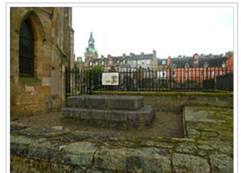
Site of the shrine of St. Margaret, Dunfermline Abbey, Fife

Several churches are dedicated to Saint Margaret. One of the oldest is St Margaret's Chapel in Edinburgh Castle, which was founded by her son King David I. The chapel was long thought to have been the oratory of Margaret herself, but is now considered to be a 12th-century establishment. The oldest building in Edinburgh, it was restored in the 19th century, and refurbished in the 1990s.